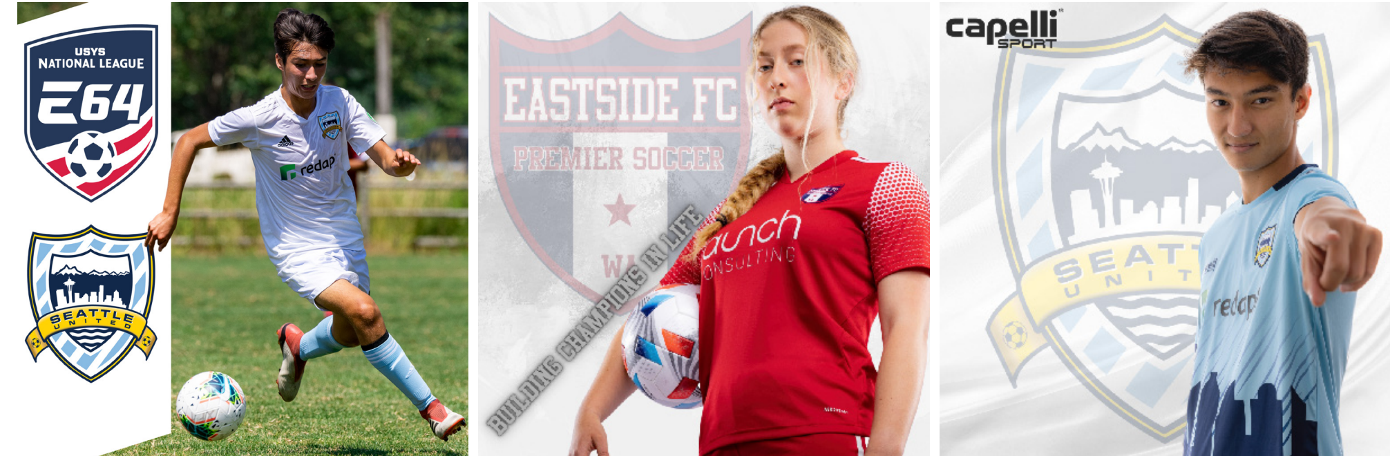
Image Driven has them all. We have the the photo and video assets covered and as a content creation studio, we have the tools and expertise transform any image we've shot into a meaningful message that audiences will respond to.

Creating engaging graphics requires three things: incredible images, the digital tools to create photos to a different level, and a creative team to deliver them for your different needs.