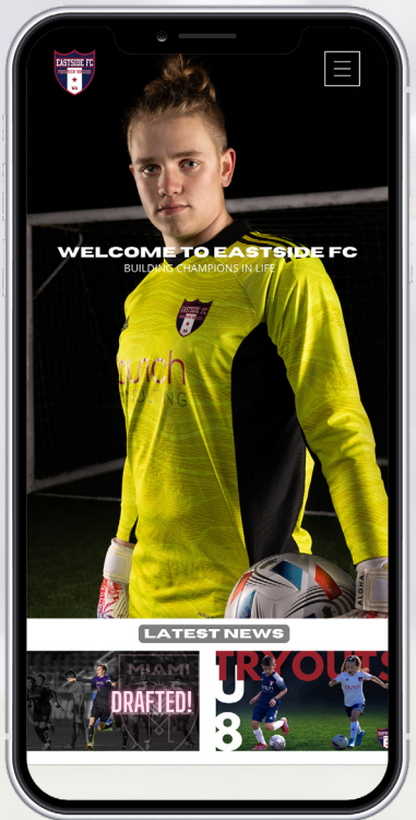
IMAGE DRIVEN WEBSITES

Most youth sports websites have three problems: They are hard to navigate, they are outdated, and they are ugly. Let's not forget that they are not mobile-friendly. Over time, players and families stop using their club's website.