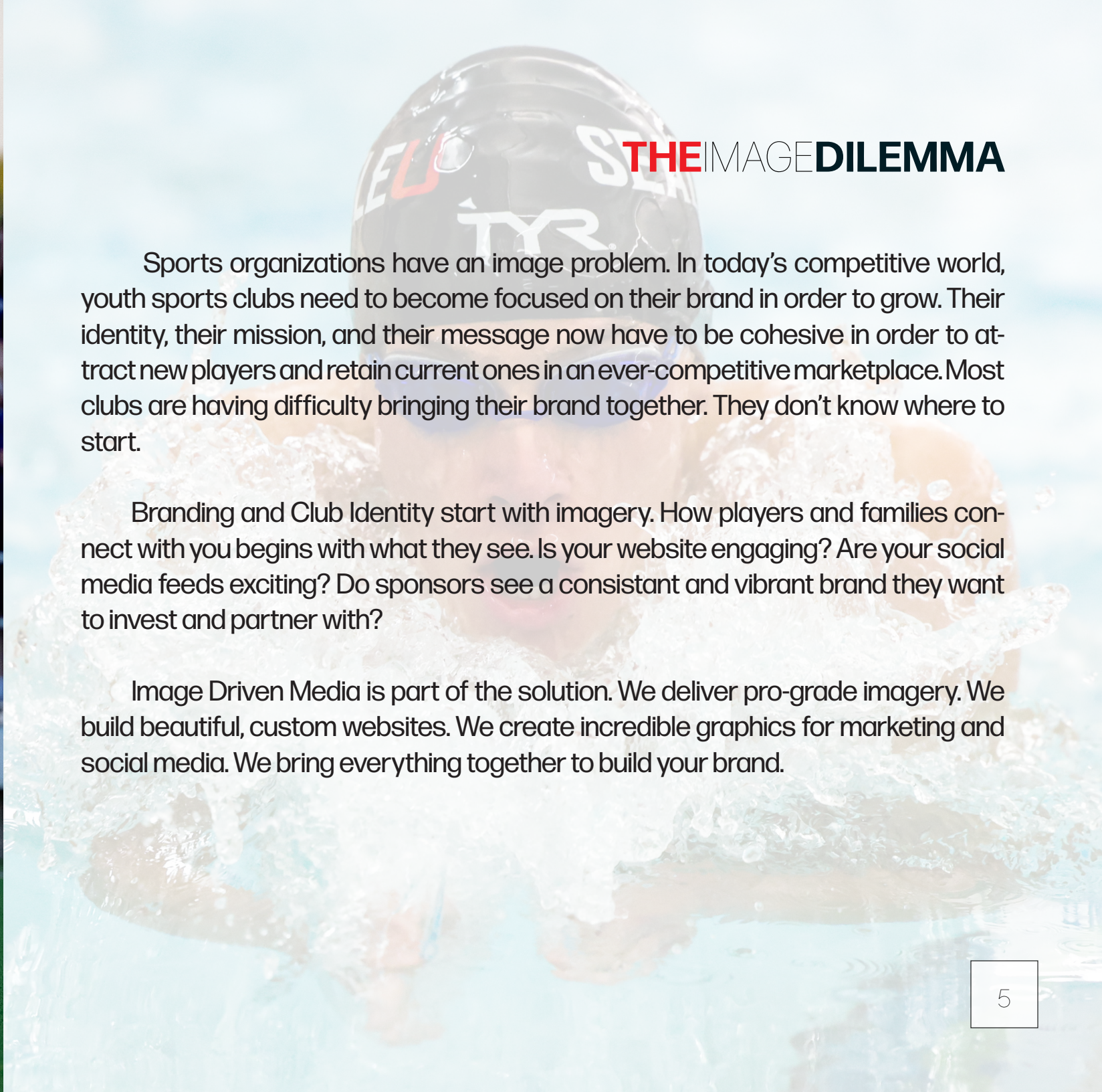
Image Driven Media is part of the solution. We deliver pro-grade imagery. We build beautiful, custom websites. We create incredible graphics for marketing and social media. We bring everything together to build your brand.

Branding and Club Identity start with imagery. How players and families connect with you begins with what they see. Is your website engaging? Are your social media feeds exciting? Do sponsors see a consistent and vibrant brand they want to invest and partner with?